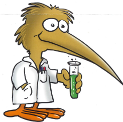
Kiwi Science Competition

Ask your teacher for details and entry form.