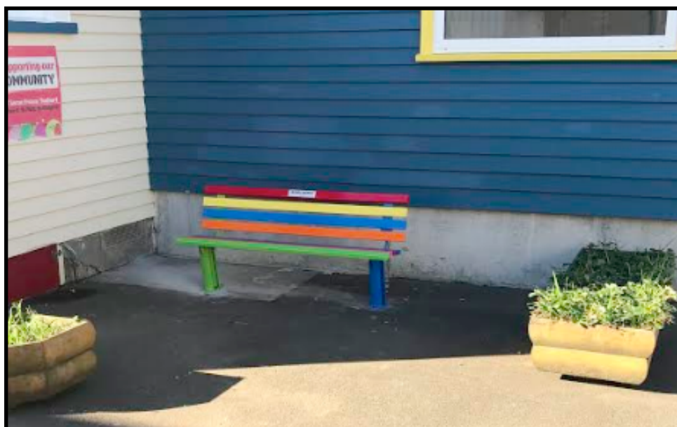
Our new 'Buddy Bench'

Week 7: Tuesday 11th June Home vs St Josephs (plate required)