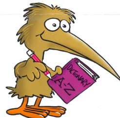
Kiwi English Competition

Designed by NZ teachers for Kiwi students based on NZ curriculum.