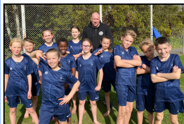
Interschool Football Team

Interschool Sports: Our Annual interschool sports competition has started for the year. A term late but I'm over the moon we have been able to take part. This involves our Year 5/6 children and the exchanges normally involve Netball, Football and Rugby. Last week we hosted Waitara East. It was so rewarding to see the kids fully engaged and playing their hearts out. It was a pretty good day for us with a great win in football. A strong rugby performance also saw us take a big win also. The highlight of the day would have been the netball game. At the end of time we were all tied up. We then played two lots of extra time and still remained all tied up. This lead us to the golden point first team to score wins. Waitara East just snuck in to take the win. But the effort, determination, grit and energy right to the last whistle from both teams was the highlight of the day for me. Our next game is against Puketapu School on Wednesday 12th August 1:00pm.