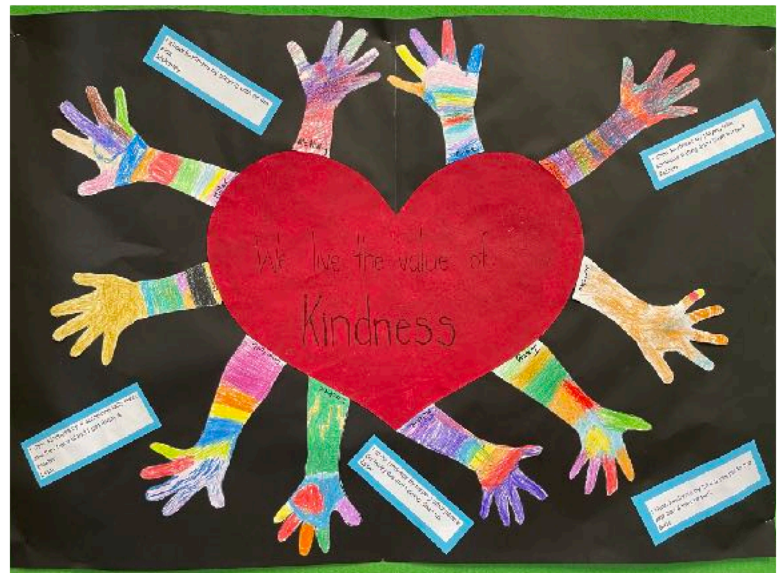
By Room Puriri