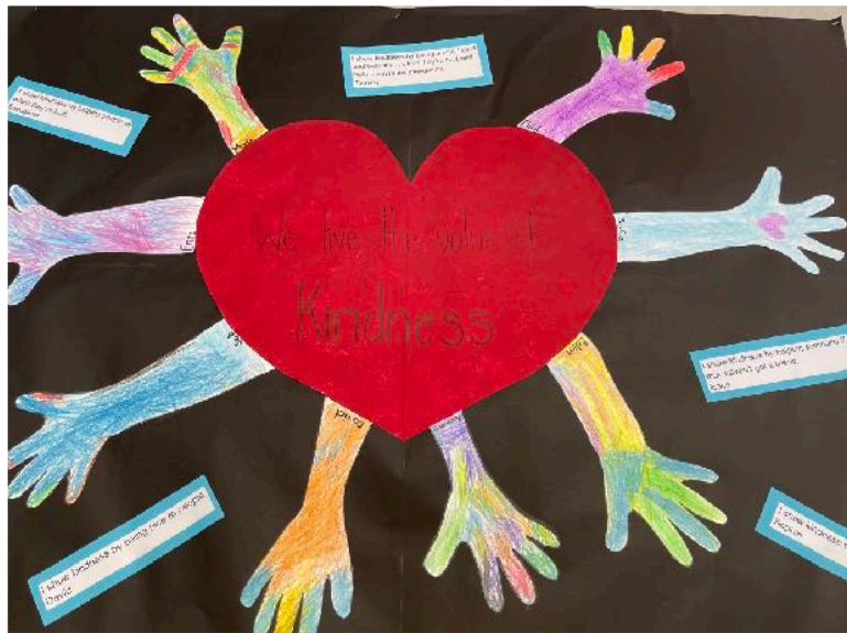
By Room Koromiko