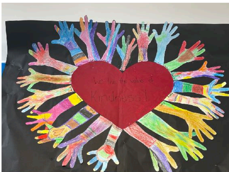
By Room Kawakawa